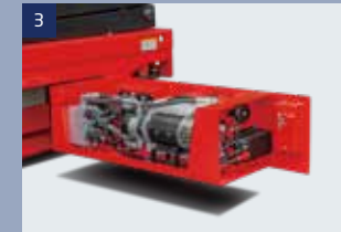
3 Hydraulic and electric system