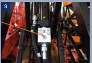
8 Explosion proof valve: To prevent the machine falling when the oil pipe is leaking