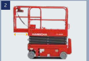
2 Extension platform