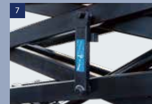
7 Supporting arms: To protect the operator when he is doing repair or maintenance job