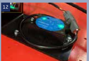
12 Angle sensor: when it is lifting and walking on the slope, the sensor will automatically judge the status of the machine, if the angle is larger than the rated angle, it will alarm to remind the operator.