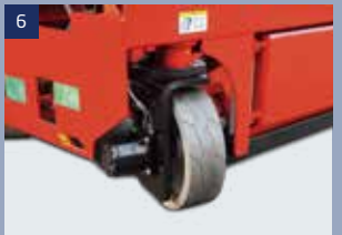
6 Traction motor