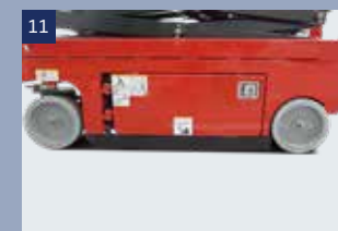
11 Anti-overturning system: When the machine raises to more than 6.5ft, this system will work automatically, to protect the machine from overturning while walking at un-leveling ground.