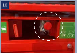
10 Manual release valve: When the machine can not move, you can push the machine after pressing this valve