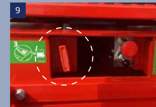
9 Manual lowering valve: When the operation system failed or the battery power is too low to let the platform decline, we can use this valve to lower the machine